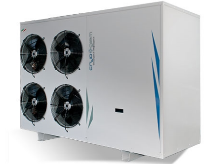
Example picture - actual product may differ

Model: US NT6226GK Codice: 003969 Type: Low Noise Condensation: Built-in (Air)